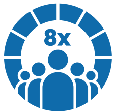
COMPANIES WITH ABOVE-AVERAGE DIVERSITY

The McKinsey/LeanIn study finds 48% of entry-level positions, but only 24% of C-suite are occupied by women.